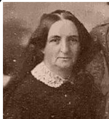
Martha Coffin Wright

until her death. Susan B. Anthony once wrote that the Osborne Family was among the movement's most important sources of funding.